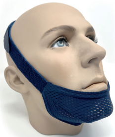
Ottawa with mesh fabric, navy blue, one-size