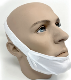
Toronto white, one size