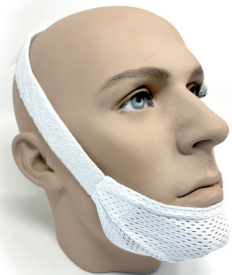
Québec with mesh fabric, white, one size